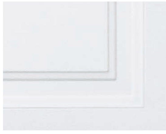
Deep panel edging and natural embossed woodgrain texture improve appearance close-up and from the curb.