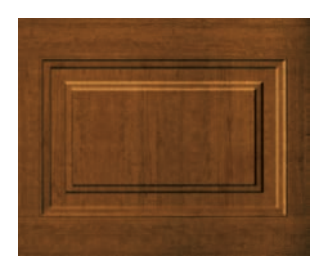
Classic Medium Finish