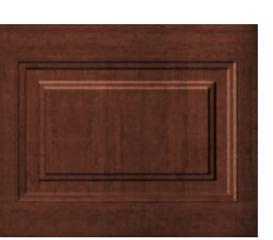
Classic Cherry Finish